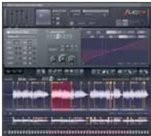
Slicex – Auto slicing & rearranging of your loops

You can't anymore. Visit a dealer today to see FL Studio in action and discover music software's best kept secret...but please, don't tell anyone.